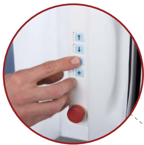
Multiple movement controls