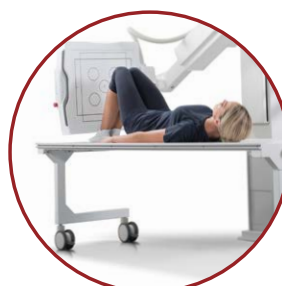
Standard accessories: DAP Trigger box Patient table