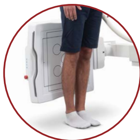
Low floor-to-beam height